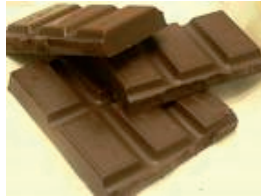
$ 2 dollars