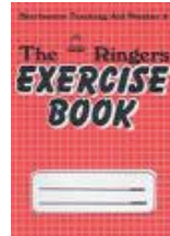
$ 2 dollars