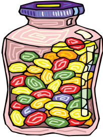
$ 5 dollars