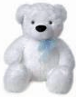
$ 30 dollars