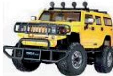
$ 70 dollars